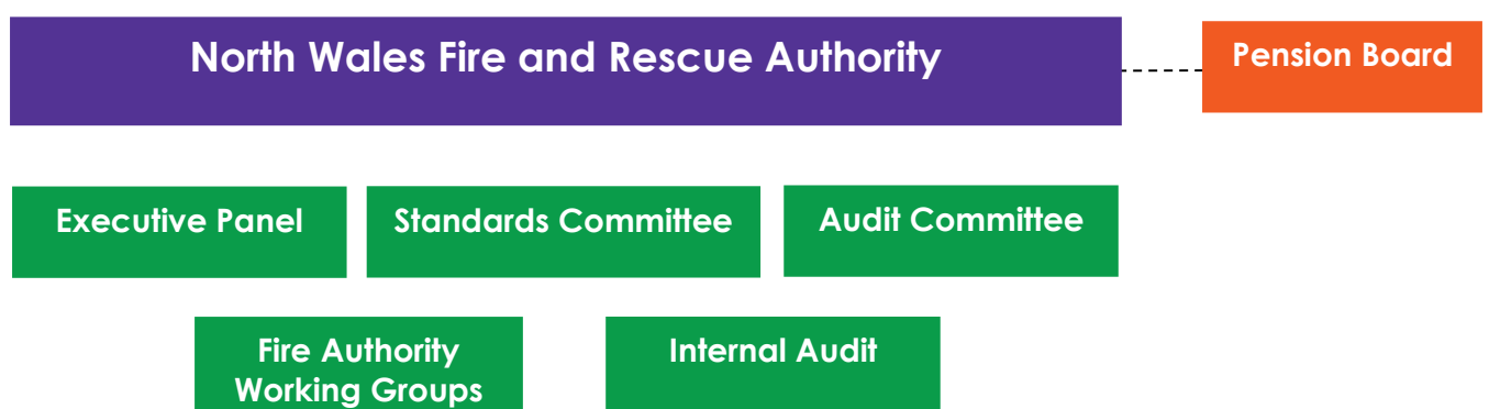
Fig 2. Committees of the Fire and Rescue Authority