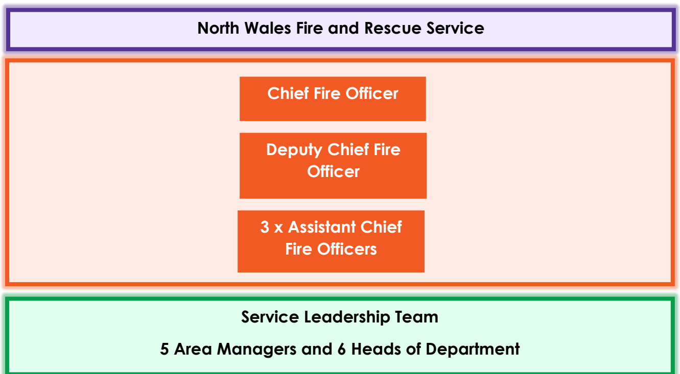
Fig 3. Service Leadership Structure

The Service Governance and Assurance Structure of committees and groups, reporting to SLT, are embedded across the organisation, demonstrating robust governance across reporting, monitoring, scrutiny and decision-making within all areas of the organisation.