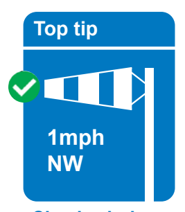
Check wind direction and speed before launch